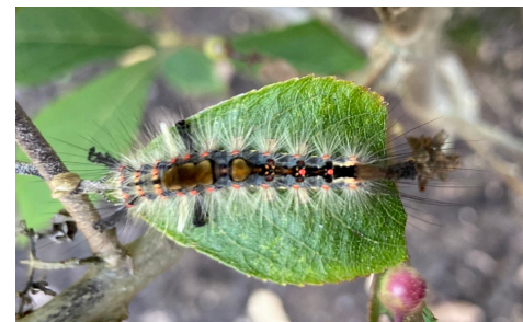
Vapourer moth (also called 'rusty tussock' moth) caterpillar

From littering to public disorder; later that week, when washing up at the kitchen window I saw two blue tits suddenly fall from the sky, locked in combat. They bundled onto the lawn, pecking at each other furiously. Then, in a flash of yellow and blue they flew up - still entwined together - and disappeared over the fence like a feathery ball battered back to the neighbour. It isn't nesting season, so presumably the fight was over food.